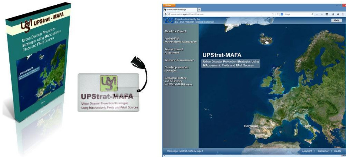
Figure 4. Distribution packages related to the Multimedia Platform. From left to right: DVD, USB card and WebSite.

In order to reach as more audience is possible by using different media the Multimedia Platform is distributed in three ways: a DVD, a USB card and the UPStrat-MAFA Web Site (Figure 4).