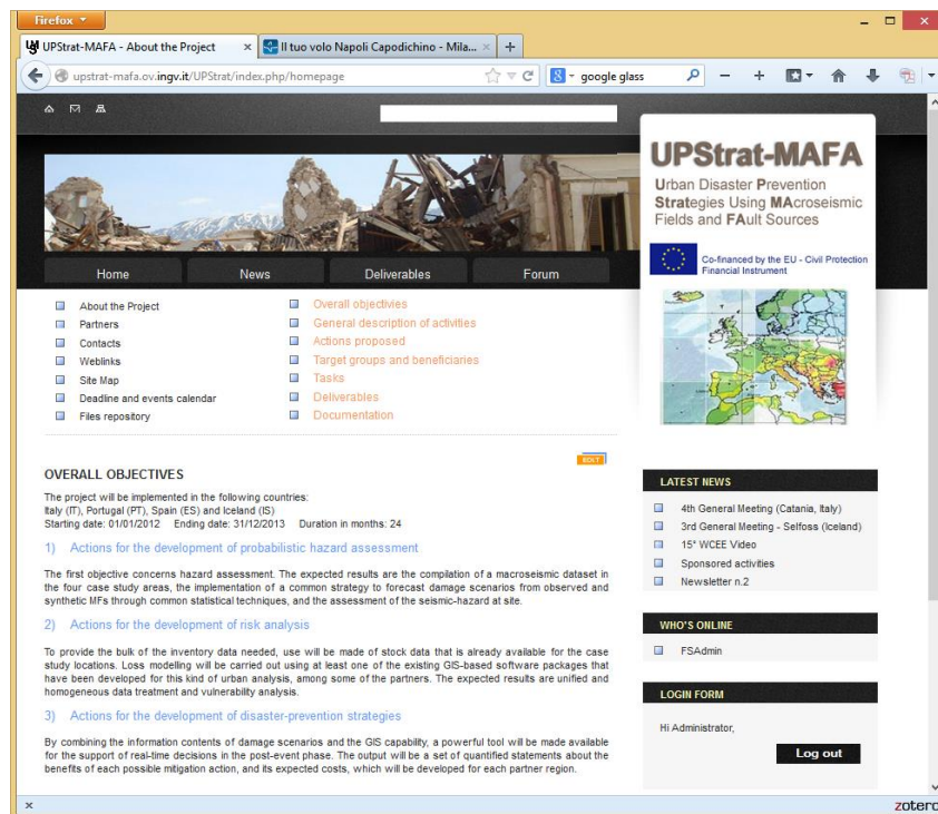
Figure 1. “About the Project” page of Web Site of UPStrat-MAFA Project

paths. Indeed the Project results can be viewed both by using a thematic menu or by following a geographic path from the home page to a page related to a specific Country (Figure 2).